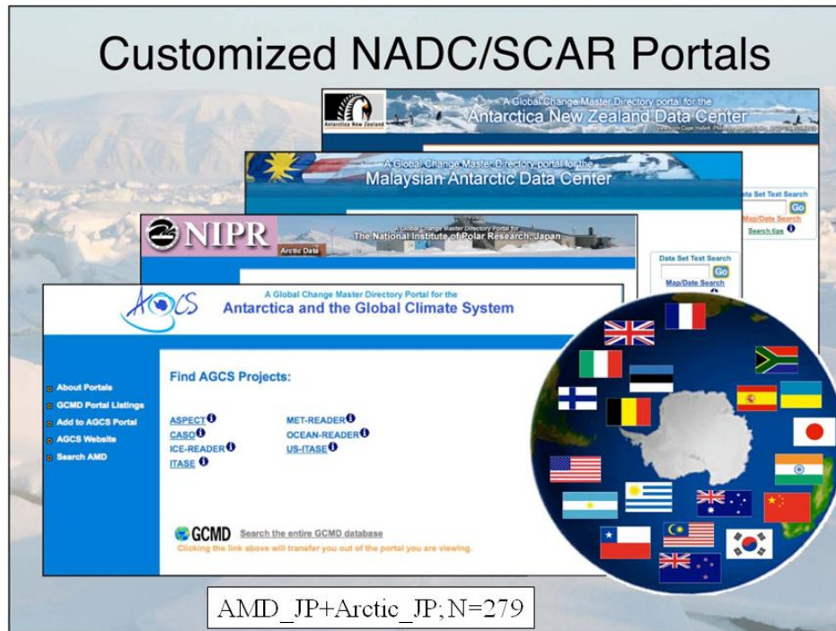
Figure 2. Japanese Antarctic portal (AMD_JP) in GCMD

GCMD ( http://gcmd.nasa.gov/KeywordSearch/Home.do?Portal=amd_jp&MetadataType=0 ; Figure 2). Hence, although PDC stores all metadata in their original format, the main items listed in the GCMD Directory Interchange Format (DIF) are also included, and metadata in both the AMDs and the PDC meta-database are closely linked.